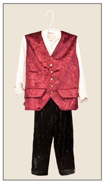
Ensemble Vest, Pants, Shirt